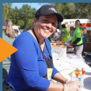
Partner Feeding Programs