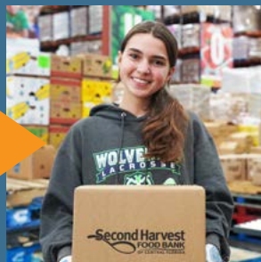
Second Harvest Food Bank