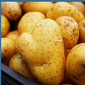
Farms, Retailers & Food Donations